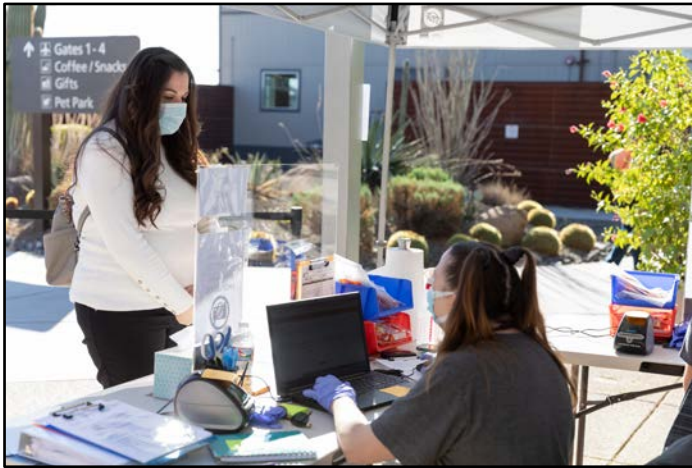
Passenger registering for free COVID-19 test at Airport