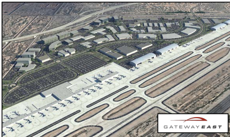
Rendering of a possible GatewayEast development concept

Gateway Airport is much more than just a thriving regional airport. It's a 3,000-acre economic development project that is fortunate to have a commercial service airport and three, 10,000-foot runways as part of its critical infrastructure. Aeronautical and non-aeronautical private development is a major cornerstone of Gateway Airport's continued success.