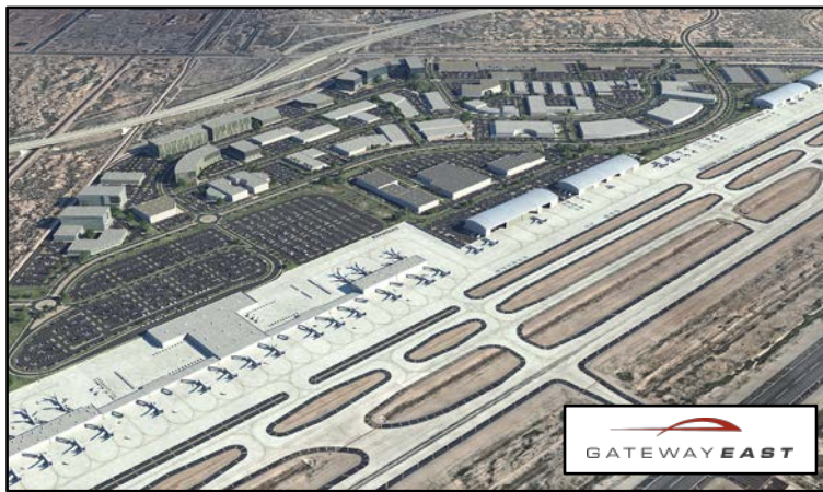
Rendering of a possible GatewayEast development concept

Gateway Airport is much more than just a thriving regional airport. It's a 3,000-acre economic development project that is fortunate to have a commercial service airport and three, 10,000-foot runways as part of its critical infrastructure. Aeronautical and non-aeronautical private development is a major cornerstone of Gateway Airport's continued success.