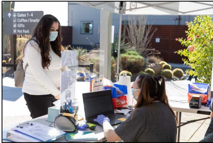
Passenger registering for free COVID-19 test at Airport